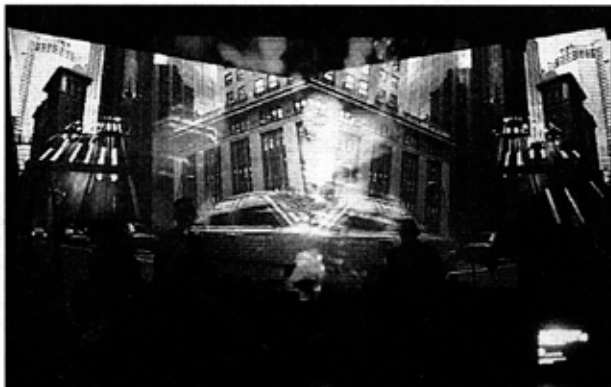
Innovative: A selection of The Light Surgeons' acclaimed audio-visual installations that form part of the region's pioneering onedotzero digital film festival