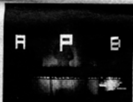
The Light Surgeons' current live show, All Points Between